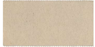
Typical R8-1 Card Back

American Card Catalog No.: ..... R8-1 Title: ..... Airplane Pictures Manufacturer: ..... Pechuer Lozeng Company (Peco) Card Dimensions: ..... 1-5/16" x 2-13/16" Number of Cards: ..... 28 Numbering: ..... 1 to 28 Country of Origin: ..... United States of America Circa: ..... 1937