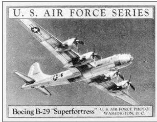
Typical Card Front

American Card Catalog No.: ..... D85 Title: ..... U.S. Planes and Warships Manufacturer: ..... Purity Pretzel Company Card Dimensions: ..... 1.85" x 2.4" (nominal) Number of Cards: ..... 56K Numbering: ..... unnumbered Country of Origin: ..... United States of America Circa: ..... Early 1950s