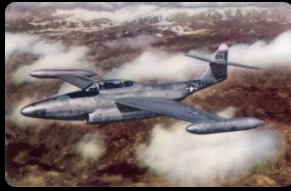
Typical F270-4 Card Front

American Card Catalog Number (unofficial): ..... F270-4 Series Title: ..... Aircraft Recognition Cards, Set 4 Published by: ..... Albers Milling Company, A Division of the Carnation Company Issued with: ..... Carnation Corn Flakes Card Dimensions: ..... 3.50 × 2.25 inches Number of Cards in Set: ..... 43 Card Numbers: ..... unnumbered Country of Origin: ..... United States of America Circa: ..... 1952 Key Recognition features: ..... Small rounded corners, two branding lines