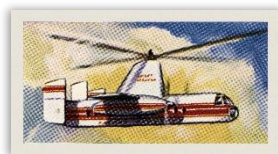
Typical Card Front

Series Title: ..... Historie de L'Aviation, Une Seconde Serie World Tobacco Issues Index: ..... A46-55-2 Issued by: ..... Amalgamated Tobacco Corporation, Ltd. Issued with: Mills, Fumez les Fameuses Cigarettes (French Text) Card Type: ..... Tobacco (overseas issue) Card Dimensions: ..... 67.5 x 36.3 mm Number of Cards in Set: ..... 25 cards Card Numbers: ..... 26 to 50 Country of Origin: ..... United Kingdom Circa: ..... 1962