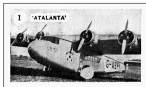
Typical Card Front

British Trade Index Number: ..... AL2-1 Series Title:..... "Aeroplanes" Manufacturer:..... Allen's Confectionary Limited Packaged with Allen's: ... "Cure-Em Quick", "Irish Moss Gum Jubes", and "Steam Rollers" Card Dimensions (nominal): ..... 63.50 x 37.00 mm Number of Cards in Set: ..... 72 Card Images; 3 back colors (216 possible) Card Numbers: ..... 1 to 72 Country of Origin:..... Australia Circa: ..... 1938