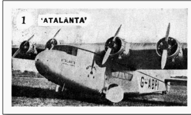
Typical Allen's "Aeroplanes" Card Front (no format variations)