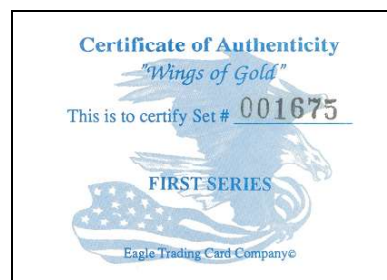
Certificate of Authenticity