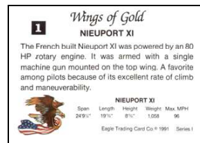
Typical Card Back

Title:..... Wings of Gold Manufacturer:..... Eagle Trading Card Company American Card Catalog No.: ..... n/a Number of Cards/ Numbering: ..... 19 / 1 to 18 Card Dimensions: ..... 2-1/2" x 3-1/2" Circa:..... 1991 Country of Origin:..... United States of America Album:..... Unknown