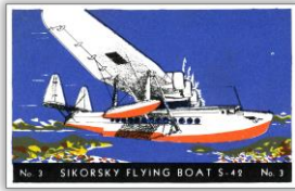
Typical Card Front

Set Title: ..... Famous Airplane Pictures, Series 1 Issued by: ..... H. J. Heinz Company, Pittsburg, PA American Card Catalog Number: ..... F277-2 Country of origin: ..... USA Year issued: ..... 1934 to 1935 Issued via: ..... Heinz Rice Flakes & Heinz Breakfast Wheat Type of card: ..... Food Issue Number of cards: ..... 3 x 25 Numbering: ..... 1 to 25 both sides Card dimensions: ..... 1-7/8 x 3 inches