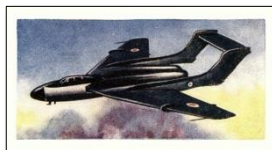
Typical HAO-1 Card Front

Series Title: ..... Aircraft of the World Cartophilic Reference Number: ..... HAO-1 Manufacturer: ..... E. M. Halpin and Co. Ltd., Ballysimon, Limerick Packaged with: ..... Halpin's Willow Tea Card Dimensions: ..... 68 x 36 mm) Number of Cards in Set: ..... 25 cards Card Numbers: ..... 1-25 on card back Country of Origin: ..... Ireland Circa: ..... 1958