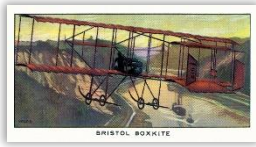
Typical KEO-2 Card Front

Issued by: ..... Kellogg Company of Great Britain Ltd. British Trade Index No. .... KEO-2 Country of origin: ..... United Kingdom Year issued: ..... 1963 Type of card: ..... Cereal card Number of cards: ..... 16 Numbering: ..... 1 to 16 on reverse Card dimensions: ..... 67 x 36 mm