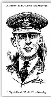
Typical L8-46 Card Front

Set Title: ..... Famous British Airmen & Airwomen Manufacturer: ..... The Imperial Tobacco Company Issued with: ..... Lambert & Butler's Cigarettes World Tobacco Issues Index No.: ..... L8-46 Country of origin: ..... United Kingdom Year issued: ..... 1935 Type of card: ..... Tobacco insert card Number of cards: ..... 25 Numbering: ..... 1 to 25 on reverse Card dimensions: ..... 36.15 x 68.16 mm