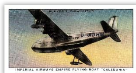
Typical P72-220 Card Front

Set Title: ..... "International Air Liners" Issued by: ..... John Player & Sons Cartophilic reference number: ..... P72-220 Packaged with: ..... Player's Cigarettes Year issued: ..... 1936 Number of cards: ..... 50 Numbering: ..... 1-50 (back only) Card dimensions: ..... 68 x 36 mm Album: ..... Yes