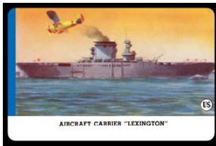
Typical Card Front

American Card Catalog No.: ..... R112-6 Title: ..... Card-O “U.S. Navy” – Series A Manufacturer: ..... Leaf Gum Company Card Dimensions: ..... 2-1/4” x 3-1/2” Number of Cards: ..... 22, 22 Numbering: ..... unnumbered Country of Origin: ..... United States of America Circa: ..... World War II