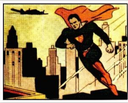
Typical R145 Card Front

Issued by: ..... Gum, Inc. American Card Catalog No.: ..... R145 Country of origin: ..... United States of America Year issued: ..... 1940 Type of card: ..... Gum card Number of cards: ..... 72 Numbering: ..... 1 to 72 on reverse Card dimensions: ..... 79.8 x 62.8 mm