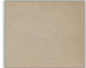
Typical Card Back

Series Title: ..... ZOOM Airplane Pictures, Series American Card Catalog number: ..... R177-1 Issued by: ..... Gum Products, Inc. Issued with: ..... ZOOM Bubble Gum Country of origin: ..... United States Year issued: ..... 1940 to 1941 Type of card: ..... Gum Insert Card Number of cards: ..... 75 Numbering: ..... Skip-numbered 1 to 100 Card dimensions: ..... 3.04 x 2.54 inches