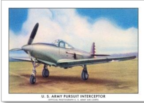
Typical T87A Card Front

American Card Catalog Number: ..... T87A Series Title:..... Modern American Airplanes, Series A Manufacturer:..... Brown & Williamson Tobacco Corporation Packaged with: ..... Wing Cigarettes Card Dimensions: ..... 2.5 x 1.78 inches Number of Cards in Set: ..... 50 cards Card Numbers: ..... 1 to 50 Country of Origin:..... United States of America Circa: ..... 1940 Album:..... Album of Modern American Airplanes,, Wings Airplanes, Series “A”