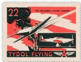
Typical Stamp Front

Set Title: ..... “American Aviation” Issued by: ..... Tide Water Associated Oil Company Country of origin: ..... United States Year issued: ..... 1940 Type of stamp: ..... Airplane Number of stamps: ..... 48 Numbering: ..... 1 to 48 on front Stamp dimensions: ..... 53.3 x 38.1 mm Album: ..... Stamp Album of American Aviation