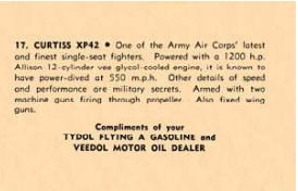
Typical UO1 "Aeroplane Series" Card Back

American Card Catalog No.: ..... UO1 Title: ..... Aeroplane Series Manufacturer: ..... Tide Water Associated Oil Company (Tydol) Card Dimensions: ..... 2-7/16" x 4" Number of Cards: ..... 40 Circa: ..... Early 1940s Country of Origin: ..... United States of America Album: ..... None known