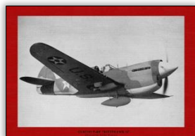
Typical Photo Card Front