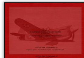
Typical Red Matte (with text)

Note 1: The photos are centered and glued onto red matte mounting paper stock. Note 2: The card title and descriptive text is printed directly onto the front side of the red matte mounting paper. The example of the descriptive printed text is shown with a transparent aircraft photo superimposed on the red matte mounting paper stock. The text shown within the aircraft image area is only visible when the “photo-flap” is lifted. The card title is always visible. Note 3: Card numbers in (light grey) are alphabetical sequence reference numbers only. The cards are unnumbered.