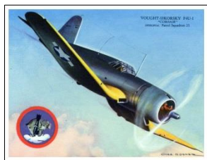
Typical W632 Card Front

Title: ..... "War Planes" American Card Catalog No.: ..... W632 Manufacturer: ..... anonymous Artist: ..... Charles Rosner Lithograph Dimensions: ..... 4½ x 5⅝ inches Number of Cards (Set 1 & Set 2): ..... 24 each Numbering (Set 1): ..... Un-numbered Numbering (Set 2): ..... 1-24 on back Country of Origin: ..... United States of America Circa: ..... 1939 & World War II